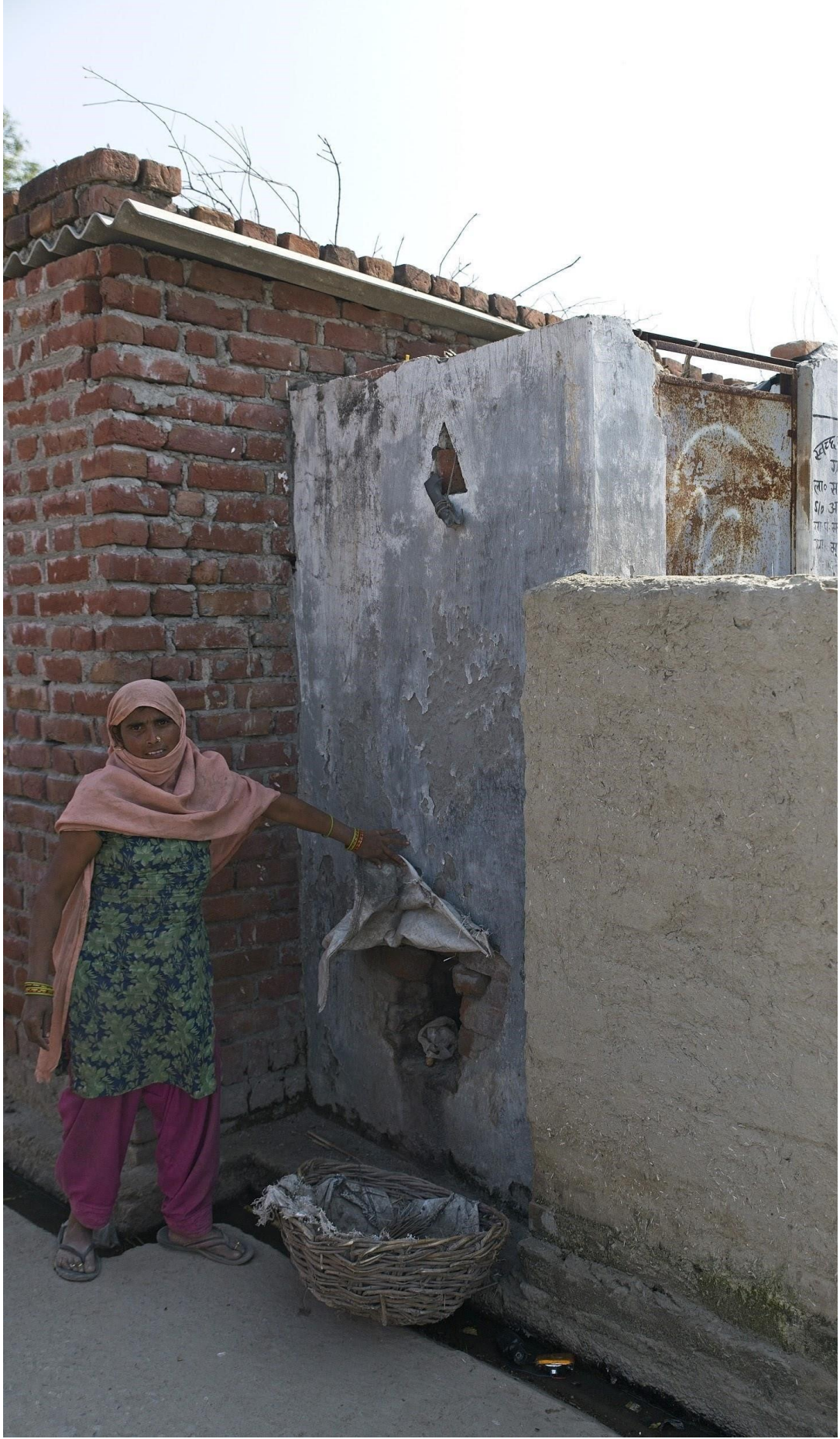
WaterAid/ Sharada Prasad